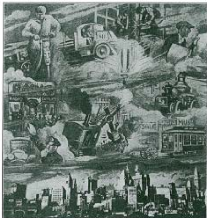
Text by Popular Science Monthly

The truck and the motor and trolley car and the elevated train