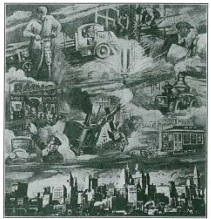
Less by Popular Science Mouthly

The truck and the motor and trolley car and the elevated train